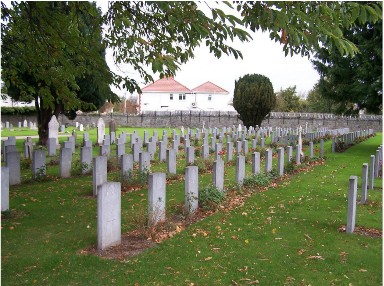
Grangegorman Military Cemetery