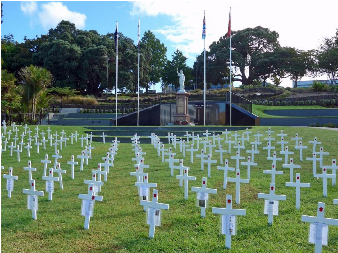
Whangarei and District War Memorial