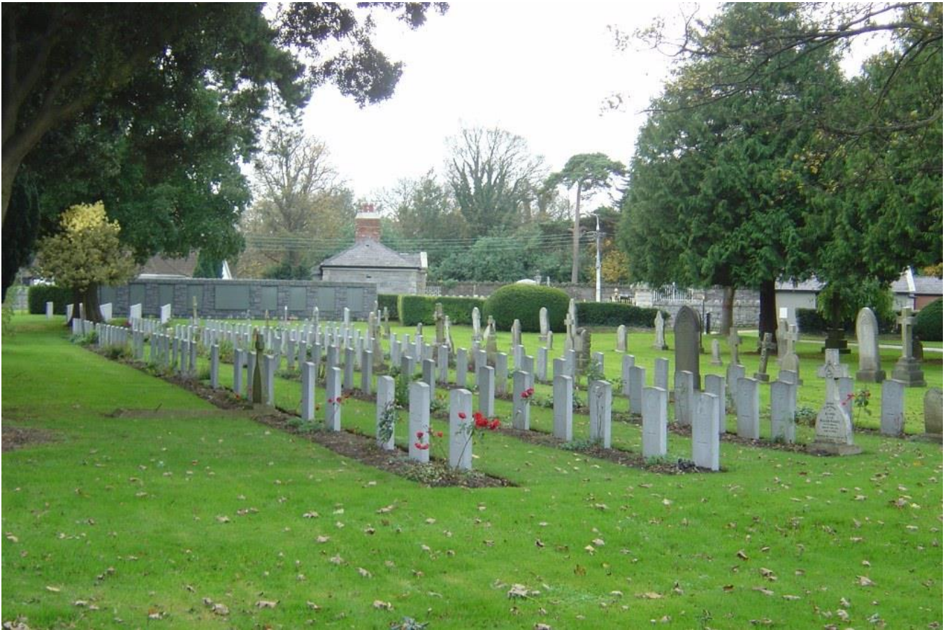
Grangegorman Military Cemetery