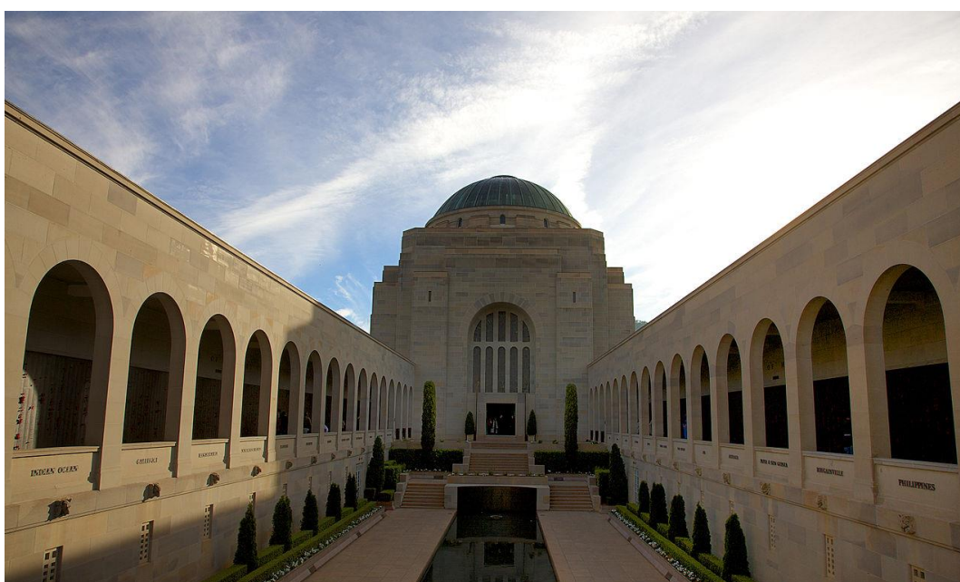
Commemorative Area of the Australian War Memorial